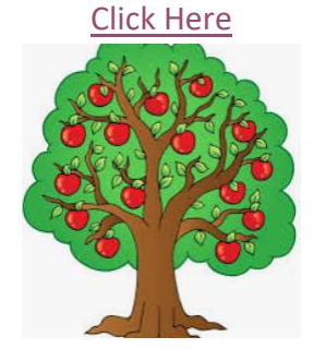
At the grocery store, see kinds of apples.